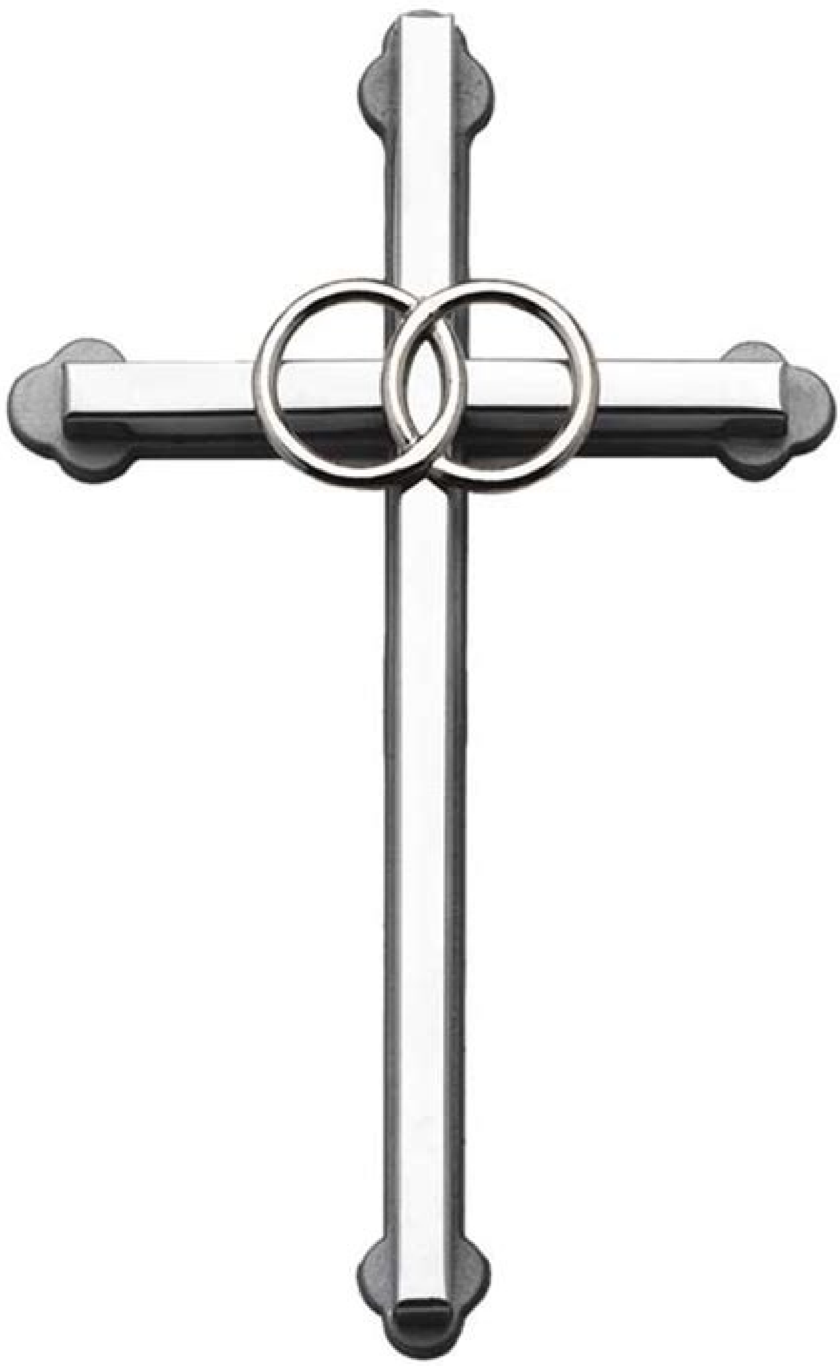
Namugongo catholic songs 2019. Catholic shona songs 2019. Catholic songs tanzania mix 2019. Catholic mass songs line up 2019. Top catholic songs 2019. Tanzania catholic songs 2019. Best catholic songs 2019. Catholic songs 2019.